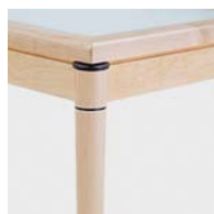
Round wood leg available in all standard and custom wood finishes.