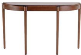
> CONSOLE #180W-481530 > WOOD TOP > ROUND BLACK DISC > ROUND WOOD LEG

An appetizing assortment of occasional tables, Mélange responds with a satisfying menu of sizes, shapes, materials and finishes that are individually specified to create your preferred combination. Accent discs in four complementary colors complete the subtle space between the top of the leg and table surface. Stand out or blend in, Mélange fits smartly within the form and function of most any space.