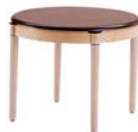
> ROUND #160W-2420 > WOOD TOP > ROUND BLACK DISC > ROUND WOOD LEG