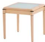
> SQUARE #170N-181818 > INSET GLASS TOP > ROUND BLACK DISC > ROUND WOOD LEG