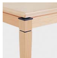
Square wood leg available in all standard and custom wood finishes.