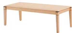
> RECTANGLE #175W-482016 > WOOD TOP > SQUARE BLACK DISC > SQUARE WOOD LEG