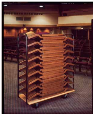
4-wheel Dolly with extension 703-4126