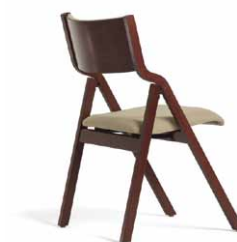
Upholstered Seat and Back, Wood backside, rear view 702-8201