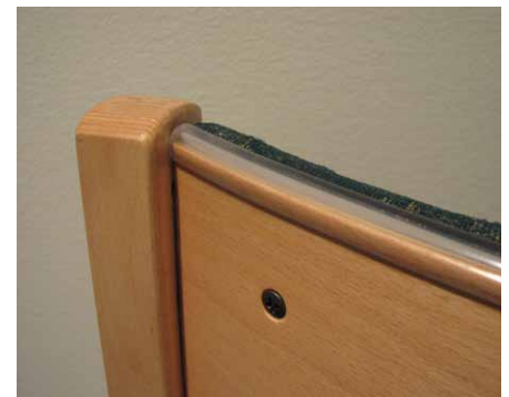
Back Edge Wall Guard