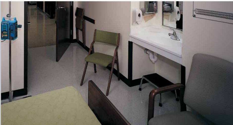
Double Chair Rail 717-0002