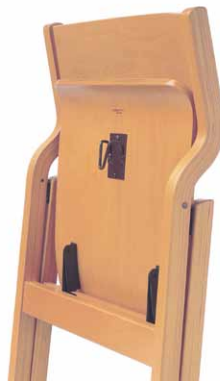
Hanging Wall Bracket 707-0004