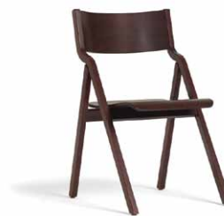
All Wood 702-3201