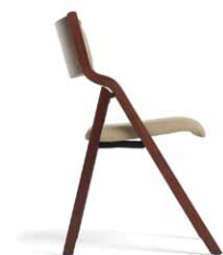
Upholstered Seat and Back, Wood Backside 702-8201