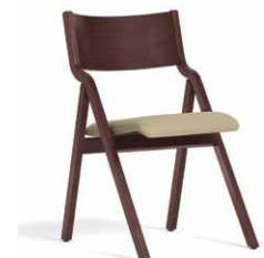
Upholstered Seat, Wood Back 702-8204