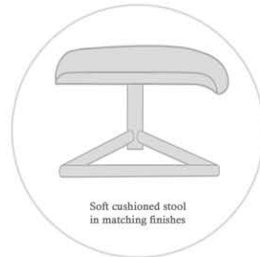
Soft cushioned stool in matching finishes