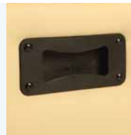
• Pull Handle