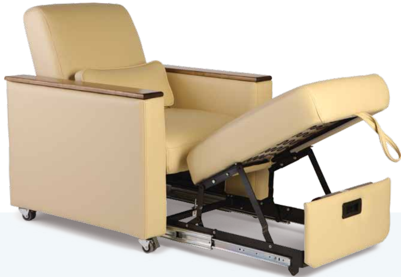
Graduation Sleep Chair by CW Studio – Alternate Views