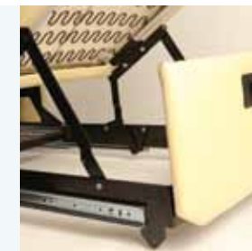
• No Sag Springs