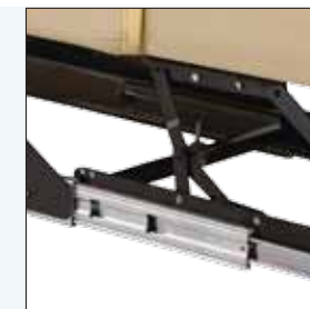
• All Steel Frame – 500 lb. Capacity