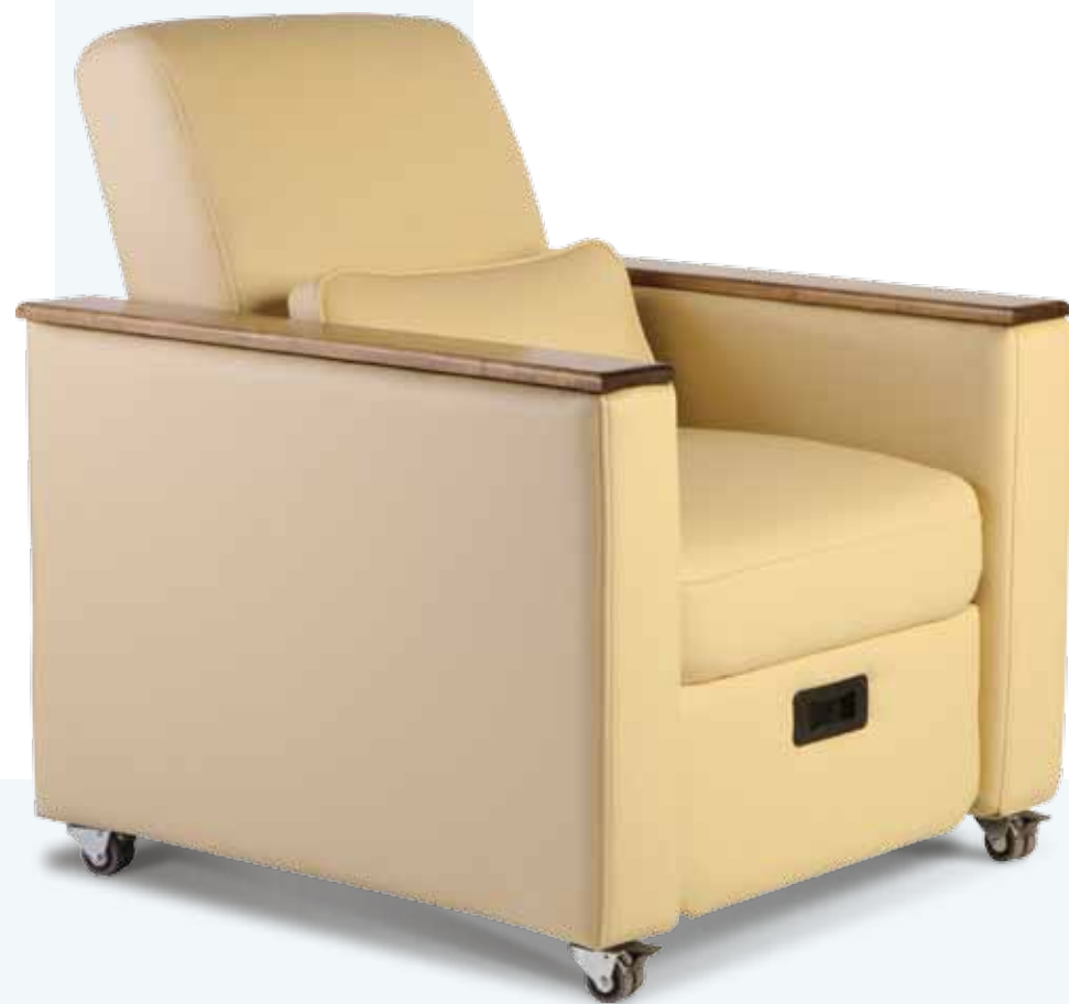
Graduation Sleep Chair by CW Studio