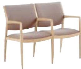
> TANDEM #4812 > 2-SEATER > PARTIAL BACK