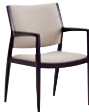
> GUEST CHAIR #4810 > PARTIAL BACK > OPEN ARM