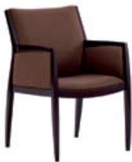
> GUEST CHAIR #4820-PA > CLOSED BACK > PANEL ARM

Ideally suited within a wide range of environments, the Ambient guest and tandem seating collection brings harmony and sophistication to any setting. Shapely arm detail, tapered leg design and a riveting silhouette are but a few examples of the indelible charm that surrounds it.