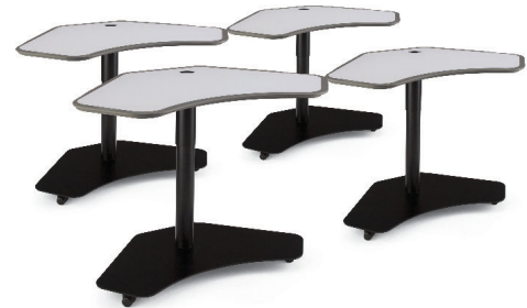
Great for classroom configurations

Wing-It™ is a personal mobile height-adjustable workstation, training table, classroom table or lectern. At home in today's office or any education environment, the Wing-It allows for unmatched flexible solutions with a unique power/data/iPod® docking station. The Wing-It's flexible design includes a lever CPU version with monitor mounts, a push button laptop version, or fixed-height version.