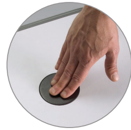
Optional push button lift