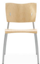
Side Chair w 20¼ h 32½ d 21 sh 19