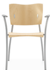
Arm Chair w 25¼ h 32½ d 21½ sh 19