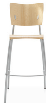
Bar Chair w 19½ h 44 d 24½ sh 31