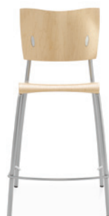
Counter Chair w 19½ h 39 d 24 sh 25½