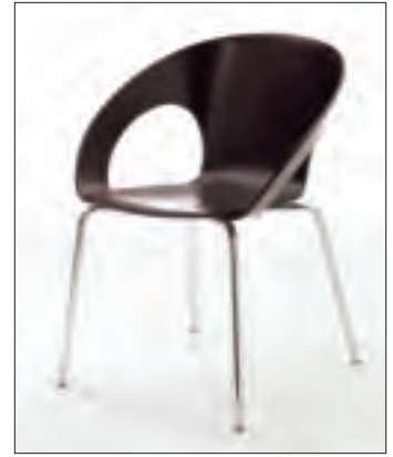
KI-7010-OA-CH 8200 Oak