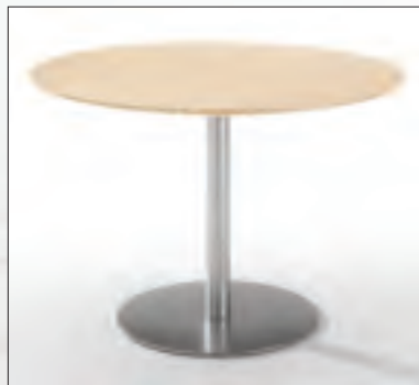
KI-7042-R-OA-SL 8100 Oak