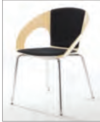
KI-7030-MM-CH 7000 Maple