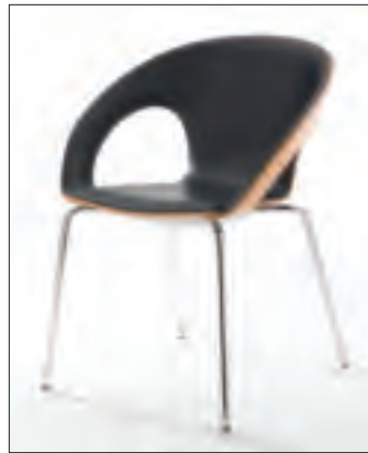
KI-7040-BB-CH 1000 Beech / Leather