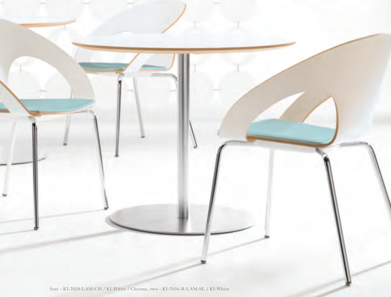
four - KI-7020-LAM-CH / KI-White / Chrome, two - KI-7036-R-LAM-SL / KI-White