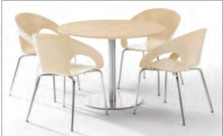
KI-7010-OA-CH / 8100 Oak / Chrome, KI-7042-R-OA-SL / 8100 Oak