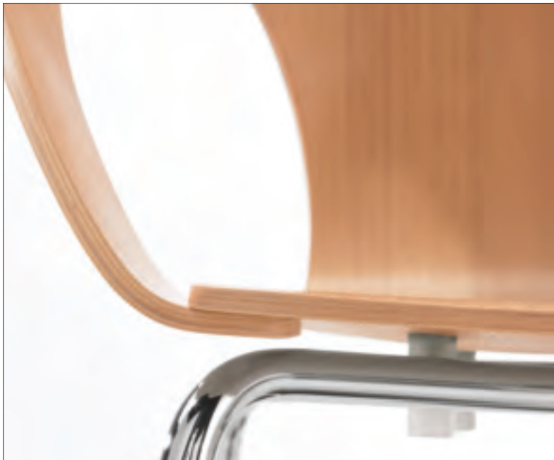
One-piece shell wraps around and is connected together to form arms.