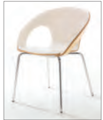
KI-7040-MM-CH 3000 Maple / Ultraleather Plus