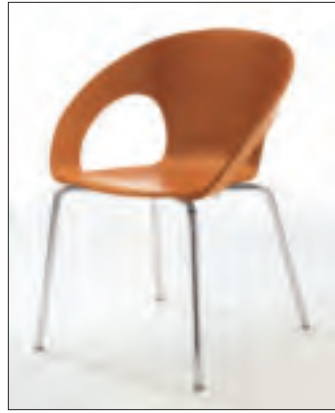
KI-7010-MM-CH 2100 Maple

Optional - KI-Felt Glides - specify when ordering