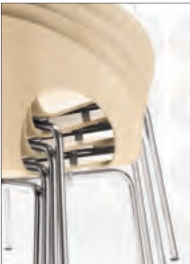
Translucent stacking bumpers for wood chairs.