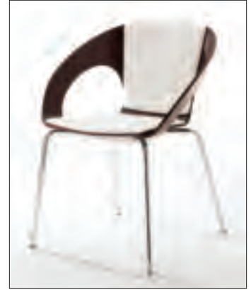
KI-7030-OA-CH 8200 Oak