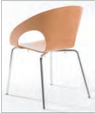
Shell has contours that fit the body and creates a unique aesthetic.